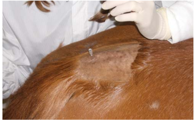
Fig. 4. Placement of 1.5-in, 18-g needle for caudal epidural catheter. Note the hanging drop.

18–22 g and 1.5–3.5 in, depending on the size and body condition of the horse (Figs. 4 and 5). If the horse is going to need multiple injections in the epidural space, an epidural catheter should be considered.