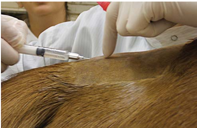
Fig. 3. Infiltration of lidocaine into skin and subcutaneous tissue before caudal epidural.