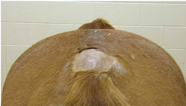
Fig. 2. Area where hair is clipped for caudal epidural catheter placement. The hair is clipped in an \sim 6 \times 6 -in ( 15 \times 15 -cm) square and aseptically prepared.

After the horse is clipped, aseptically prepared, and blocked, the injection can be performed. The needle or spinal-needle sizes that can be used are