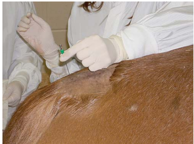
Fig. 5. Proper insertion of spinal needle for a caudal epidural injection.

Before injection, the syringe should be ready with aseptically drawn medication, and sterile gloves should be used. The intervertebral space should be palpated again before placement of the needle. The owner or a technician should move the tail up and down to relocate the injection site. The horse should be standing squarely, and the needle should be placed midline. The needle is placed almost perpendicular to the plane of the skin with the bevel of the needle facing cranially. The needle is pushed downward until the inarcuate ligament (ligamentum flavum) is perforated. 2 Sometimes a popping sensation is noted when the ligament has been punctured. 2 If the needle is advanced too far and the floor of the vertebral body is reached, the needle